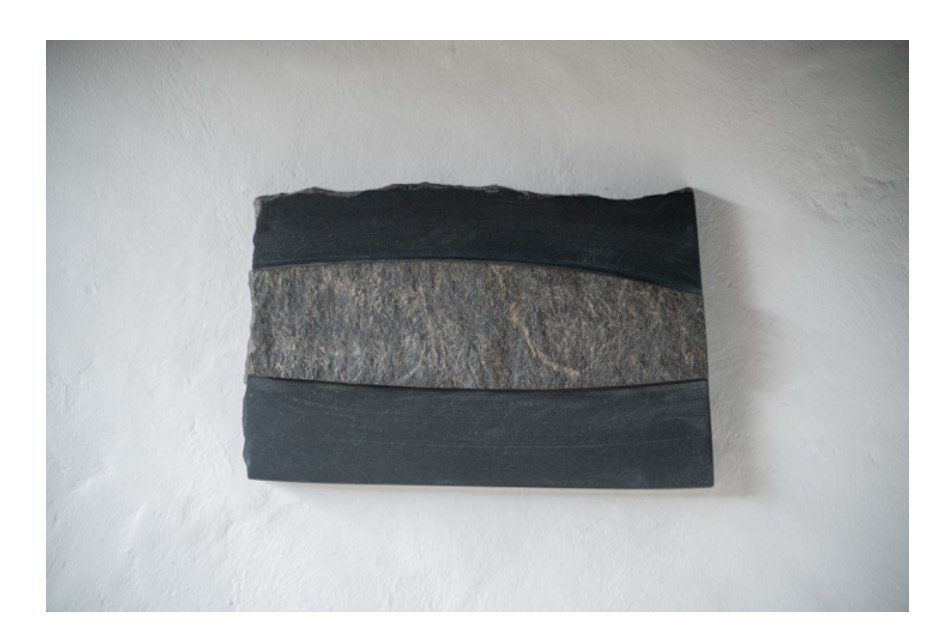
Land IV, 2022, basalt, 19 x 28 x 5cm

Honed for colour and for formal and spatial considerations, the carvings also reveal their initial formation and expose an inherent sense of infinity within their composition. Harvey's simple, silent forms are distilled to an essence that invites contemplation. Principally made by carving, paring down and refining, these sculptures are honed as much by creative impulse as by concept.