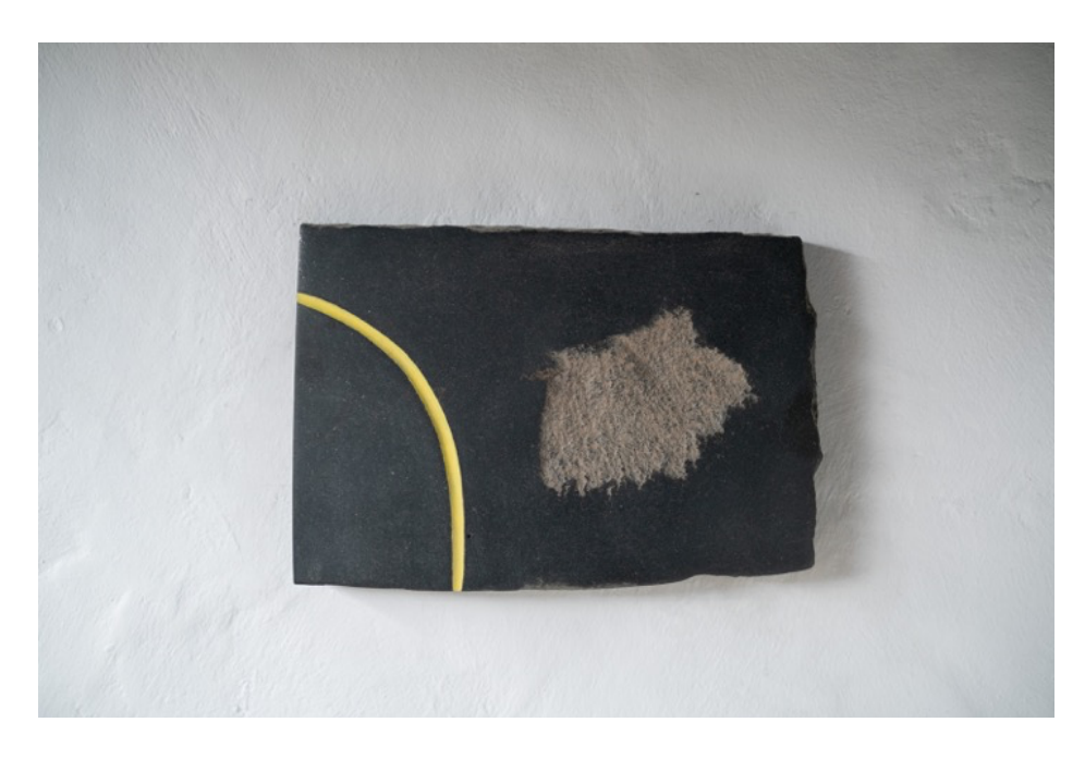
Ware 2022, basalt and yellow enamel, 19 x 26 x 5cm