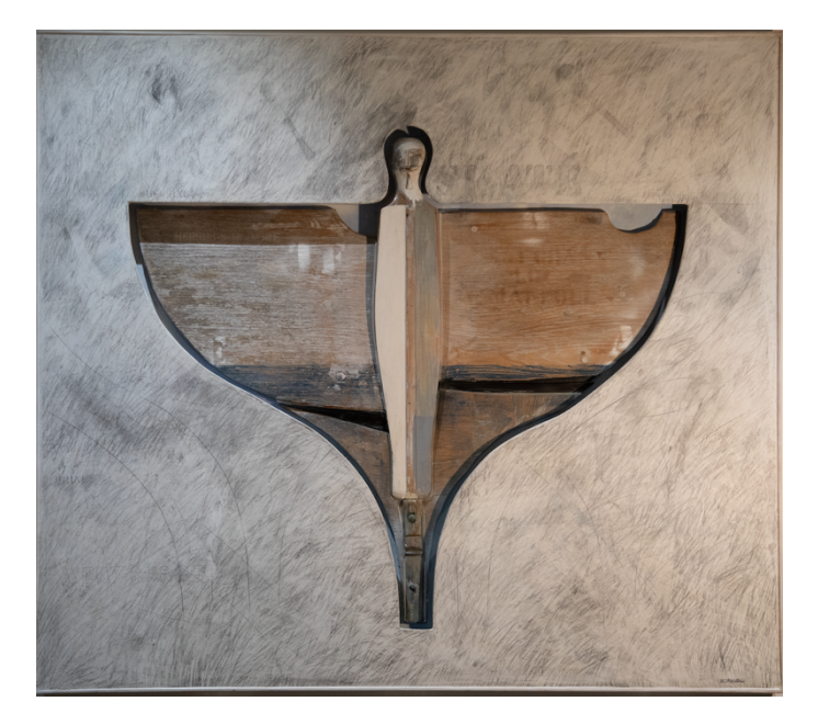
Fhir a Bahta, 2012 mixed media construction, 109 x 123 cm