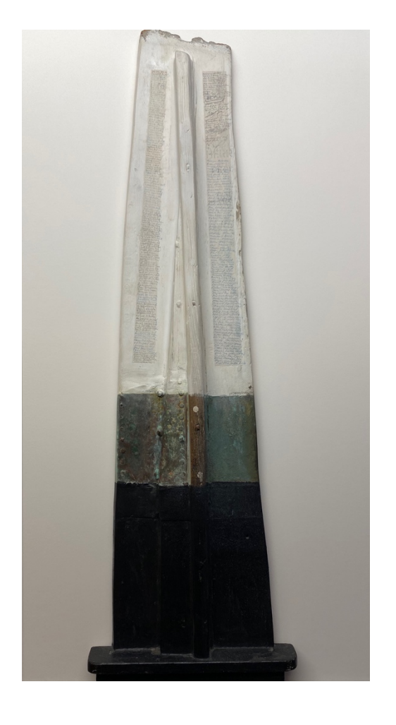
The Voyage of the James Caird to South Georgia, 2012 mixed media and found objects 67 x 52 x 9cm

Memory Board, 2012 mixed media and found objects 109 x 24 x 6 cm