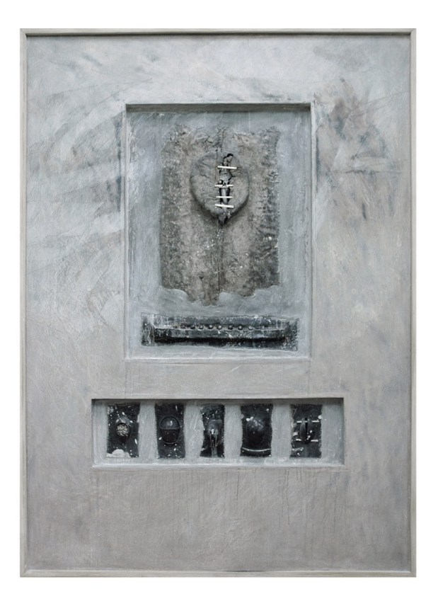
A Short History of North Rona, 2010 lead and mixed media, 154 x 102 x 7cm