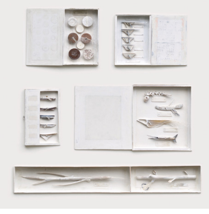
Cover: Mariner's Museum, Taxonomy of Tides, 2014 mixed media construction, 123 x 108 x 9.5 cm

Award for three Memorial Cairns in Lewis. The British Library and Tate's Artists Lives Sound Archive made a valuable recorded interview with him in 2005, the year he was awarded an MBE for services to Education and the Arts.